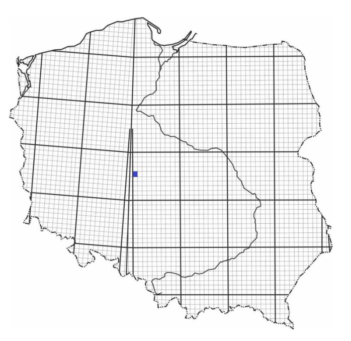
Figure 3. The place of observation of the last recording of a dragonfly in December in 2017 in Poland in UTM-squares 10x10 km.we

The distribution of sites where dragonflies were observed in the late autumn period indicates areas where favourable weather conditions enable dragonflies to be still active. Taking into consideration all the inaccuracies resulting from unequal number of observers in various areas of Poland, it is clear that in October (middle autumn), sites were scattered in the whole country (apart from mountainous areas). The greatest accumulation of sites was recorded in the lowlands and uplands, smaller number of sites were in the area of the lake district and in the north of Poland (fig.1). In November (late autumn) (fig.2), the accumulation of observations was similar to the one in October. Nevertheless, the distribution of observations was restricted to the lowlands and uplands (the greatest majority of them was concentrated in the centre and the southern part of Wielkopolska (Greater Poland) and Silesia. The only one, single observation from December (fig. 3) was recorded in the centre of Wielkopolska (Greater Poland).